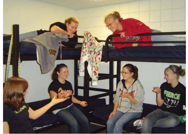
Gustavus welcomes youth and adults from congregations for a retreat experience at Gustavus and offers GYO & Partners to visit congregations.